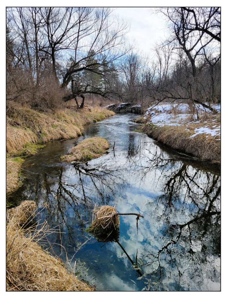
Winona County's Beaver Creek, a designated trout stream, flows through a narrow valley. The Winona County SWCD's Clean Water Fund-backed work with landowners on feedlots has contributed to water-quality improvements.

"In the 12 years I've been with the district, this is one of the first delistings I've been a part of. I think about the number of practices in that small watershed that have been installed since I've been here, and it's pretty awesome to think about the improvements that have been done, especially up