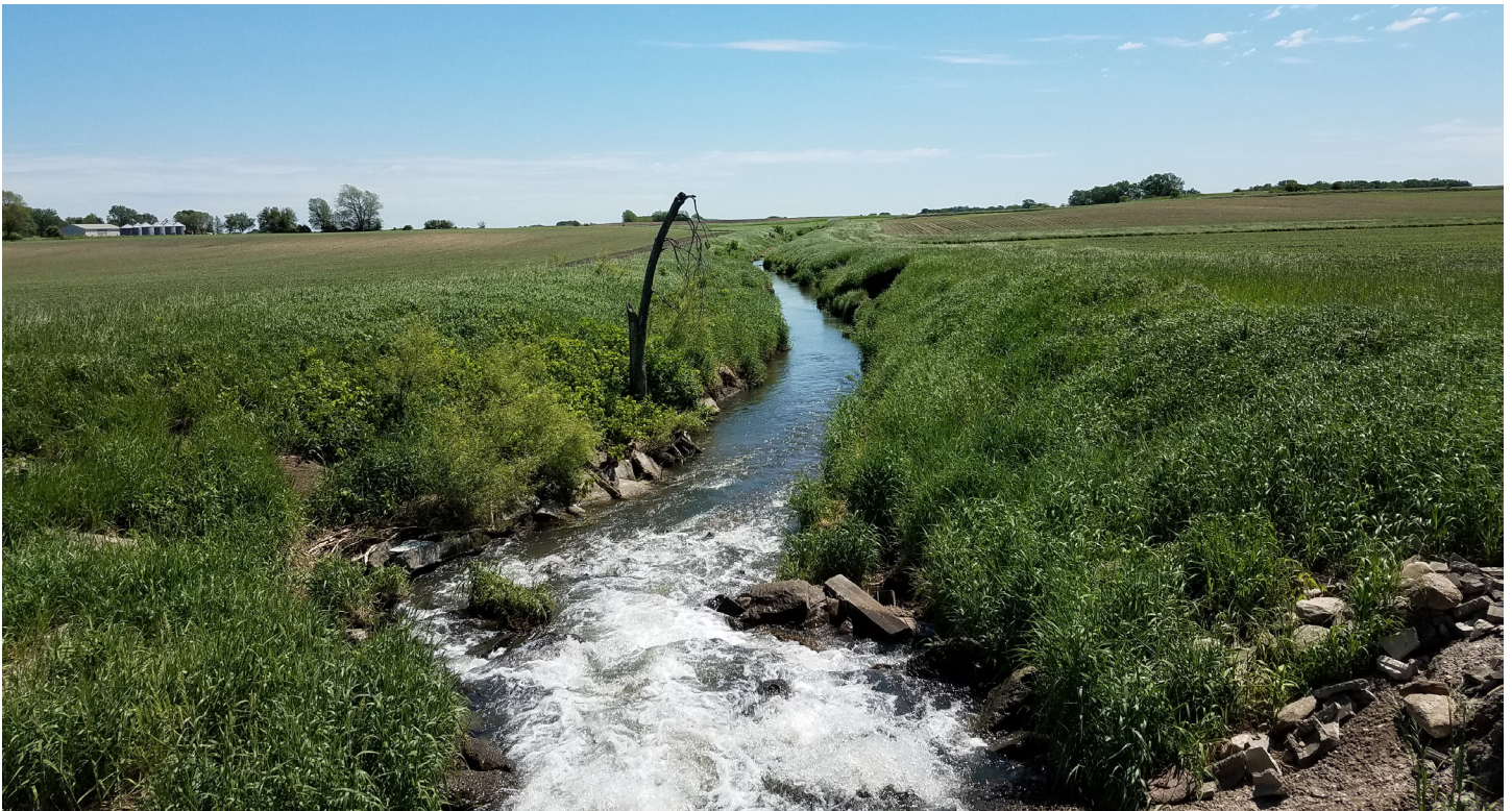
A 16.5-foot buffer — the standard width prescribed by the buffer law for public ditches — was installed along this stretch of a Watonwan County ditch.