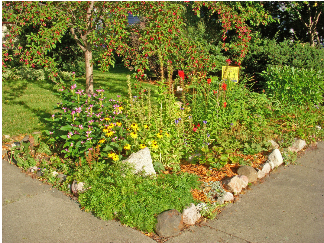
An example of a mature pollinator planting, Metro Blooms selected this garden to receive its “best rain garden” award in 2008. Rocks are used as edging, creating straight lines to help organize the garden and make it visually appealing.

Make habitat connections: Identifying areas where you can expand existing plantings is another consideration in site selection. I like to round off corners in my yard to make it easier to mow. If you can connect areas of habitat on your property, you will create benefits for a wider range of species. Connecting nesting areas with food sources can aid pollinators moving through the landscape.