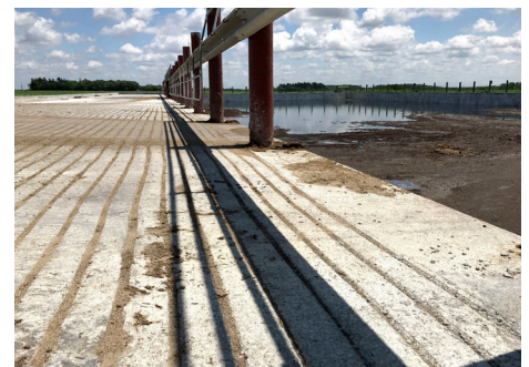
Left: The fencing Ben and Jay Currier installed along the edge of the pit can be raised and lowered. Having two points to scrape manure into the pit gives them an option if buildup occurs during winter freezes. The 1.4 million-gallon design allows for increased volume due to rainfall. Middle: The previous storage area, left of the open barn door, held a week's worth of manure. Right: Grooves in the concrete increase traction.