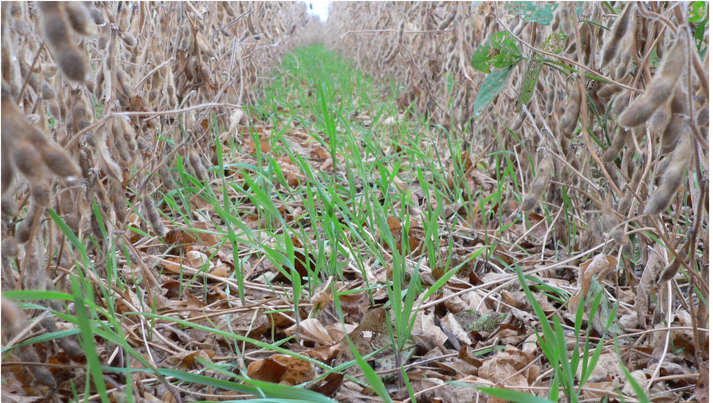
A Traverse County producer who enrolled land in Traverse SWCD's cover crop demonstration program planted cereal rye into a soybean crop.