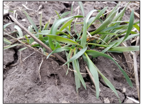
Kernza grows in early April on a field within Edgerton's drinking water supply management area. The perennial crop will help reduce nitrates in drinking water.