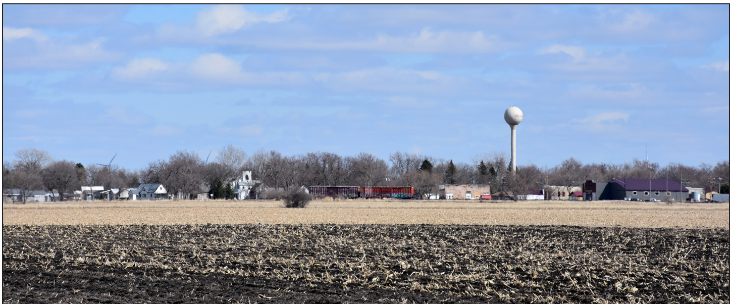
Holland residents get their drinking water from Lincoln Pipestone Rural Water. Some farmers with land in drinking water supply management areas near Holland and Edgerton are working with Pipestone SWCD to implement soil health practices meant to reduce nitrates.

Lincoln Pipestone Rural Water took four of its eight wells at Holland and North Holland offline in 2017 because a byproduct of its nitrate treatment had the potential to cause a different type of pollution. An experimental treatment that reduced nitrate levels to zero was discontinued because it was cost-prohibitive, and Minnesota Pollution Control Agency funding was available to help connect to South