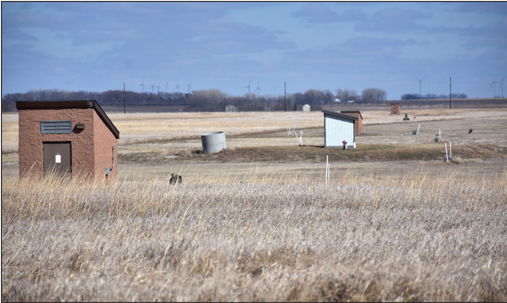
Lincoln Pipestone Rural Water's Holland treatment plant draws water from a shallow aquifer. LPRW also buys water from sources in South Dakota and Iowa.