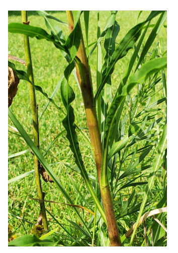
Meadow blazing star's lower leaves are about 8 inches long.

stars' flowers emerge in late summer and can last for weeks. Flowers open from the top of the stem down. Plants produce 30 to 100 purpleto-magenta flowers per head, and one to 40 heads per stem. Flowers are described as thistle-like, feathery and fluffy. Bracts are purple to red, flattening as they mature.