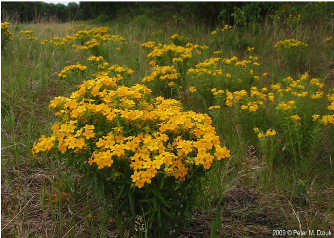
Left: Carolina puccoon.

on the leaves. The flowers of fringed (narrow-leaf) puccoon ( Lithospermum incisum ) are yellow with fringed edges.