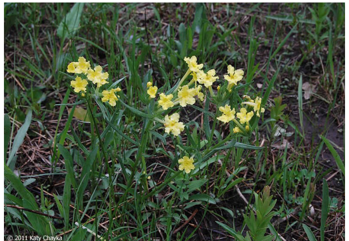
Right: Fringed puccoon.