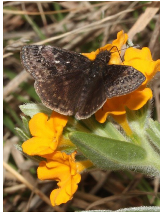
A wild indigo duskywing sips nectar from hoary puccoon.

Native Americans used the dye produced from the roots to color chewing gum red. The foliage contains pyrrolizidine alkaloids that are toxic to mammals,